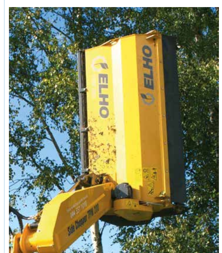
Note! The above cutting units are designed for the SideChopper TPM Power arms.

TECHNICAL SPECIFICATIONS are given without obligation and may be amended without prior notice. Rights to structural changes are reserved. The price list valid at the time of sale takes precedent in matters of prices and equipment. Contact your local retailer for more information.